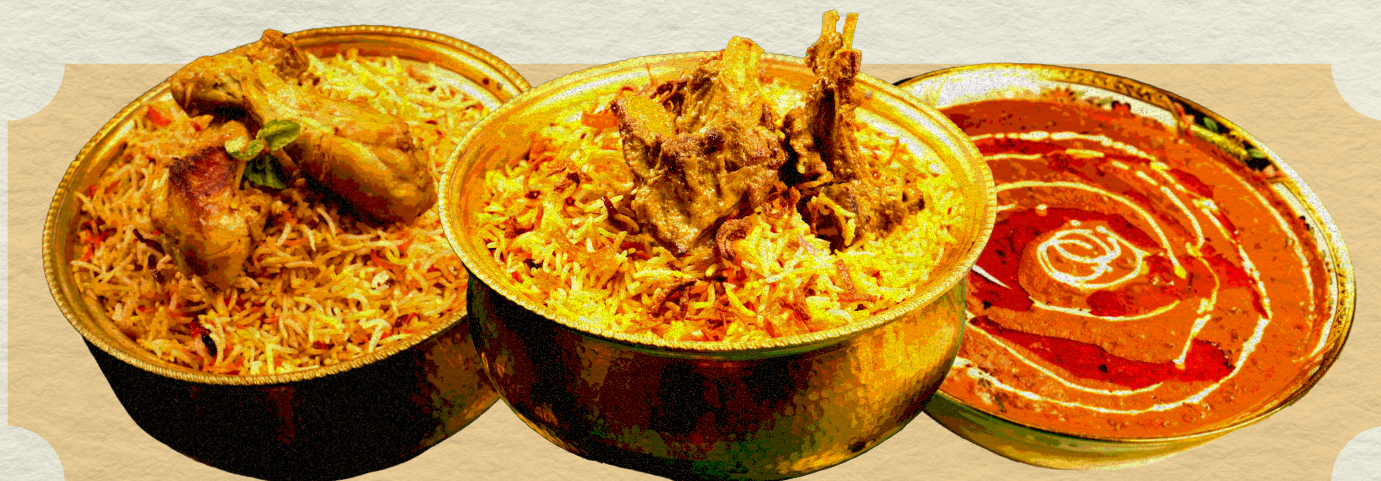
Nawab's Murgh Dum Phukt Biryani

Fluffy, fragrant rice gently steamed to perfection—light, delicate, and the perfect companion to any dish.